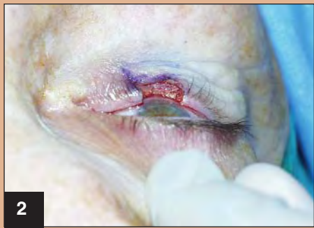
2 Defect remaining after all tumor is removed