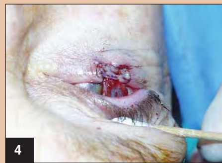
4 Tarsoconjunctival flap with skin graft in place.