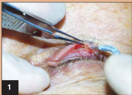
1 Horizontal incision through the lower two-thirds of the tarsus

Once the tarsus is divided, Muller's muscle and the levator aponeurosis are dissected from the underlying conjunctiva until the tarsus can lie in the defect with no upward tension when the eye is closed. This might require dissection to the superior cul-de-sac. Care must be taken not to interrupt the suspensory ligament of the conjunctiva, which is in the superior cul-de-sac. I attach the tarsus of the flap to the remaining tarsus in the lower lid with 5-0 chromic sutures on a spatula needle.